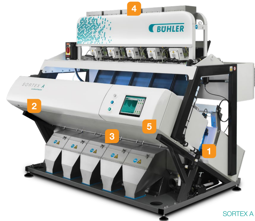
SORTEX A LumoVision