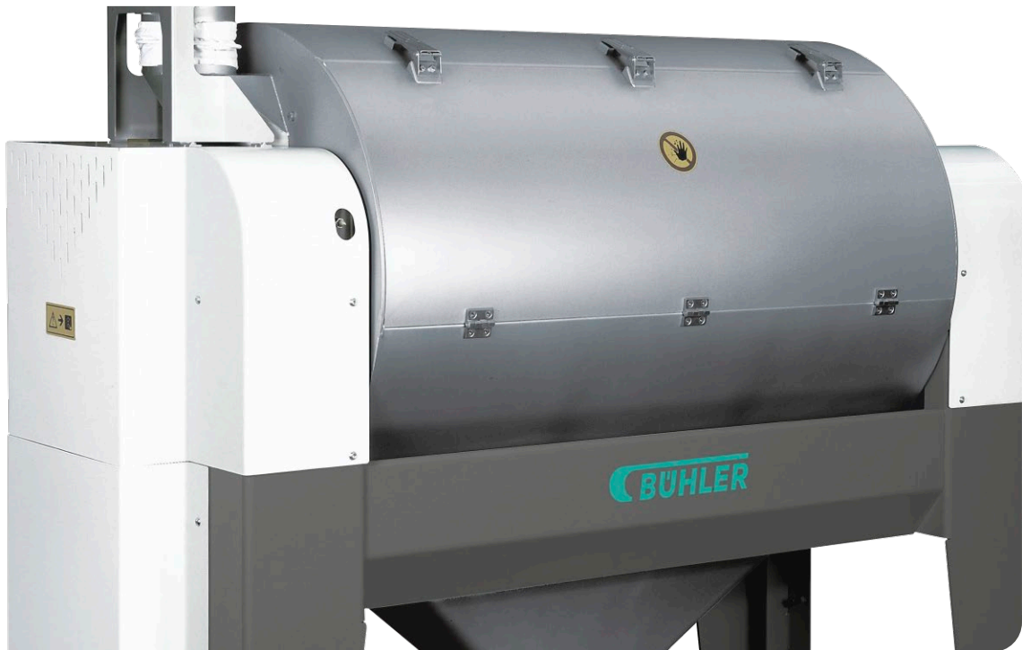
Vibrosifter, for efficient sifting of the end product.